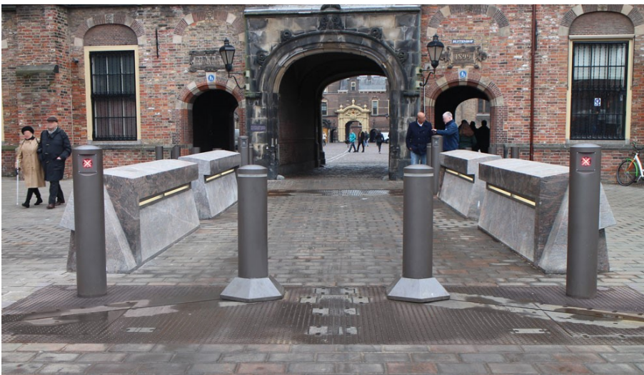
Image above illustrates possible surface finish – bollards above are weathering steel which is designed to rust. Below are stainless steel bollards with steel plate surface.

The system comprises a large plate on which sit two (or four) automated bollards which slide to open and allow vehicles through plus warning system to make pedestrians aware when opening/closing.